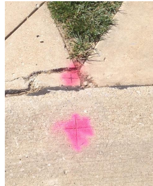
Cross on curb and in driveway