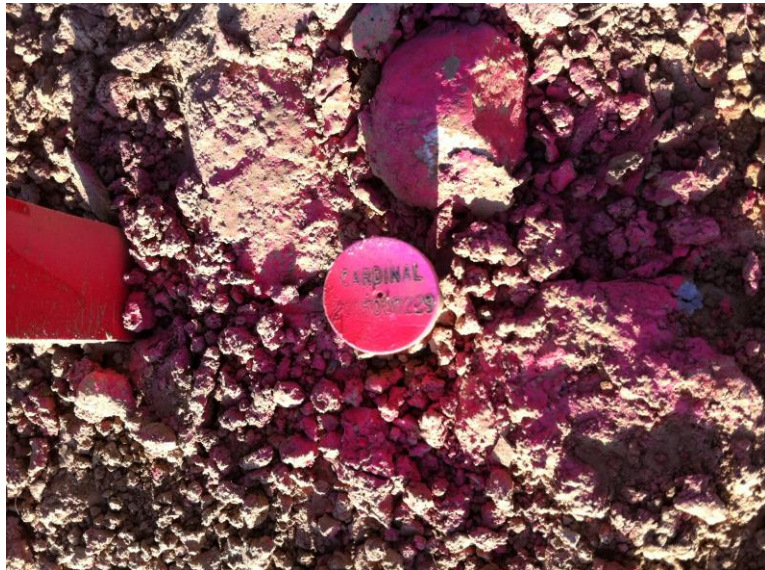
Rebar with cap