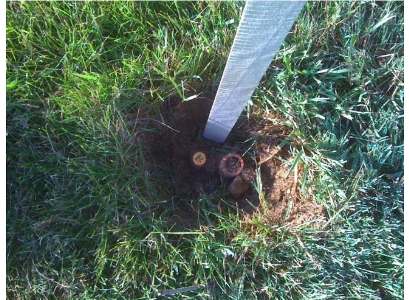
Double monument (iron pipes)